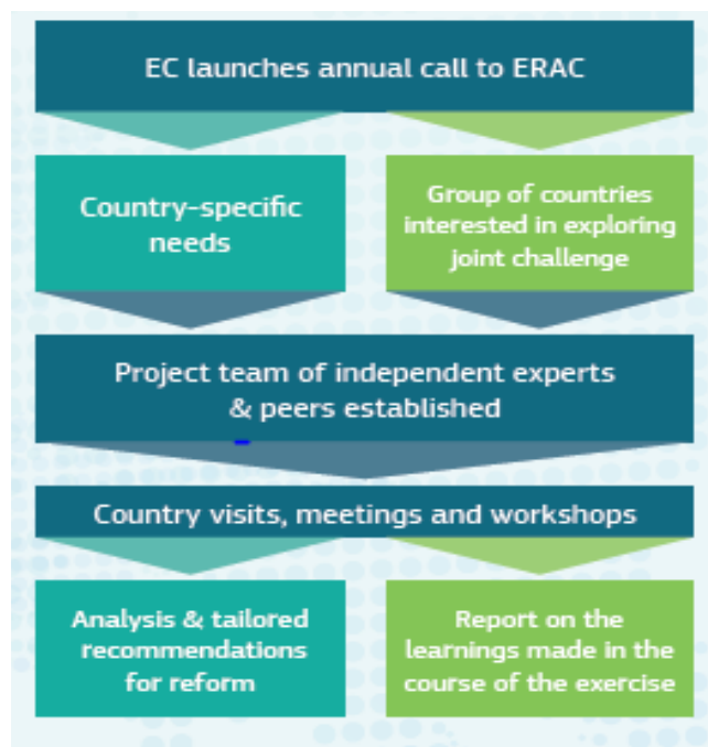
Figure 1. The PSF cycle

The fourth expression of interest in PSF services was sent to ERAC on 13 June 2017 (with deadline 15 September 2017) and served as basis for the planning of the 2018 PSF activities. As a result tailor-made policy support will be provided to Malta, Cyprus, Montenegro, Estonia and Latvia. Two new Mutual Learning Exercises (MLEs) will be launched: one on Research Integrity and the second one, jointly with the OECD, on the Digitalisation of science and innovation policies . The concept notes describing the scope of these MLEs will be circulated for ERAC's feedback and ERAC delegates will be asked to express their country's interest in joining these activities in due time. Since there is an increasing demand for PSF support, some of the requests (e.g. Armenia) are planned to start in 2019.