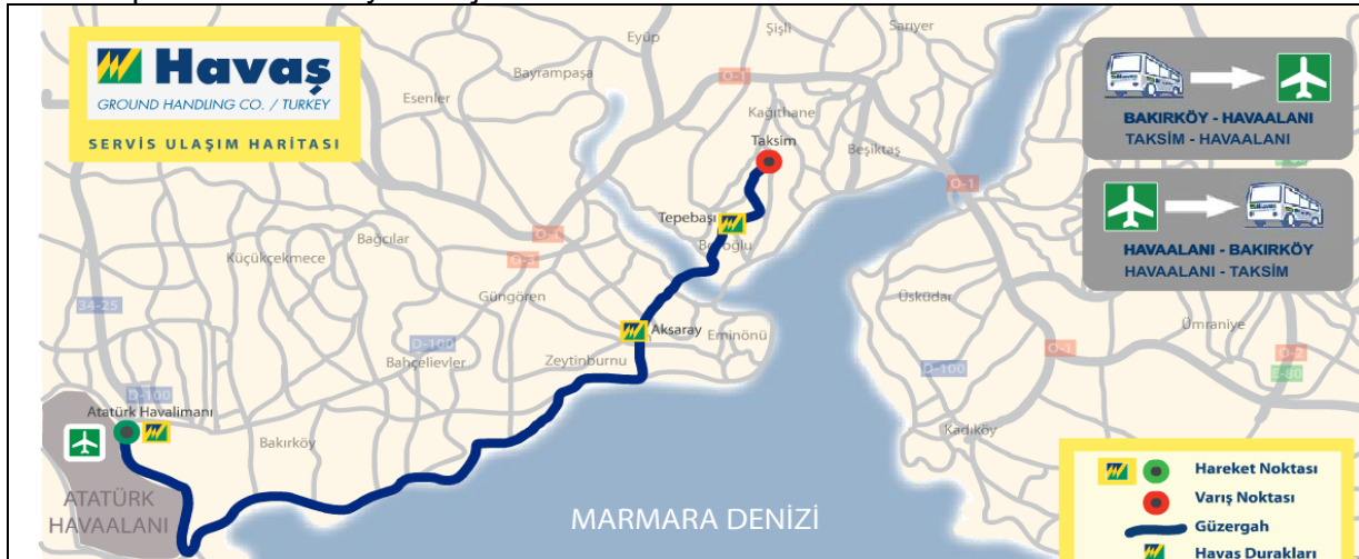
From Airport to Taksim by Havas

http://www.havas.net/en/shuttle-parking/istanbul-ataturk-airport/