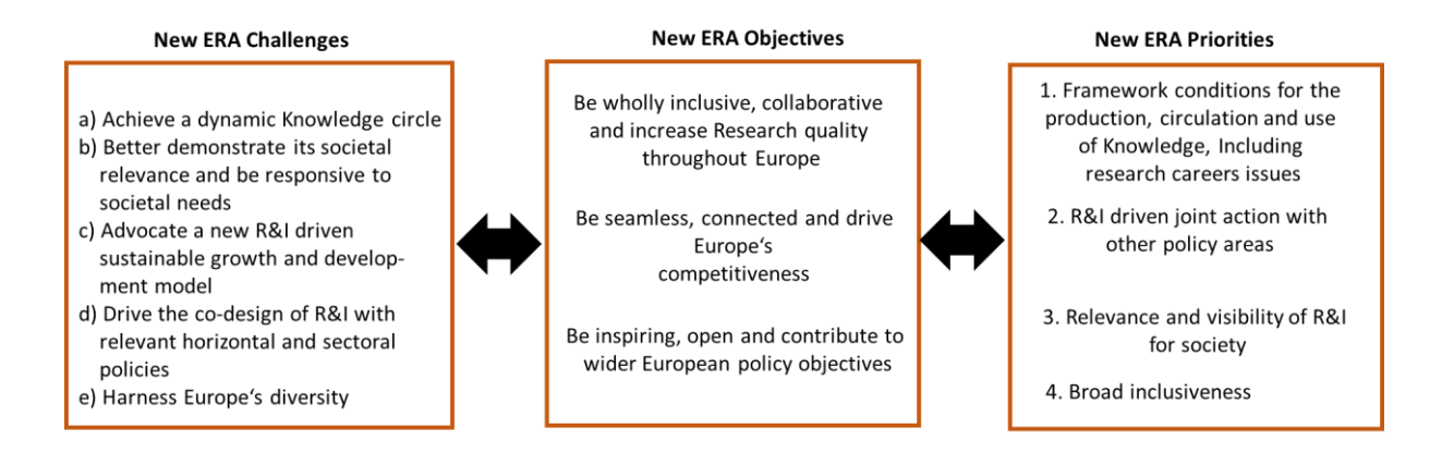
Figure 2: Relationship between the new ERA challenges, objectives and priorities.

Figure 2 illustrates the relationship between the ERA challenges, the ERA objectives and the ERA priorities.